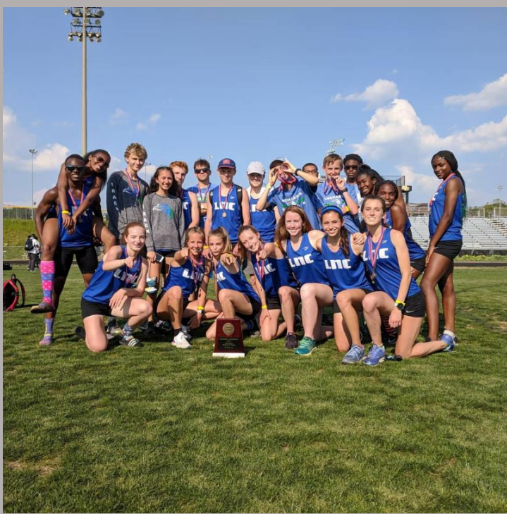
HS Track team